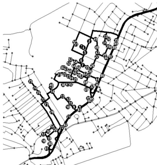
Figure 3. The optimized route