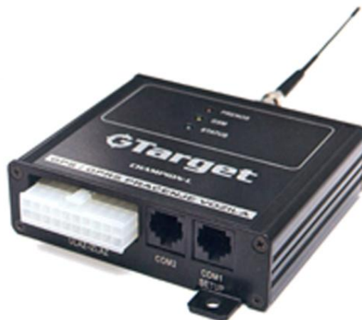
Figure 1. G-Target device

G-Target device determinate the vehicle's position using GPS module built in the device (latitude, longitude, velocity, driving direction, time, etc. ), compress the attained data and send them over the GSM network and Internet to server's software G-Target SVR. G-Target SRV receives the data from the device and put them into database. In the same way it receives the commands from the user and sends them to the device over the client's software G-Target CLI.