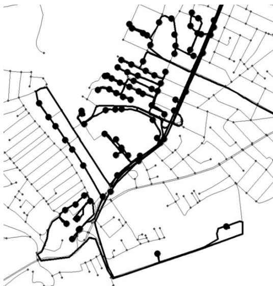
Figure 2. The current route

Table 1 summarizes the computational test results which indicate to 28.1% in route length. The total savings for this optimized route is 2710 kilometers per year.