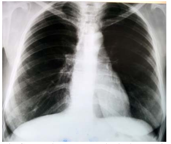
Fig. 4 – Chest radiography on patient's discharge from hospital treatment, showing complete regression of all previously described changes.

According to the results of all examinations which were performed, the diagnosis of the CSS was set, and the patient began treatment with high doses of corticosteroids, while montelukast was discontinued from further asthma treatment. Soon after the systemic corticosteroid therapy was introduced, regression of all signs and symptoms, and radiographic changes were notable (Figure 4). During the following year, she was weaned off oral corticosteroids and now she has intermittent asthma that is controlled by inhaled corticosteroids/long-acting beta-2-agonists ICS/LABA combination (salmeterol/fluticasone 50/500 \mu ) twice a day therapy.