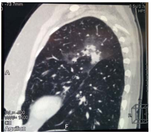
Fig. 3 – Multislice computed tomography (MSCT) of the chest, lateral view, showing changes in the form of ground glass and an infiltrate in the upper lobe of the left lung.