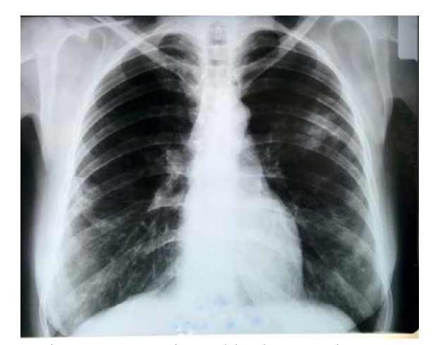
Fig. 1 – Chest radiography showing accentuated interstitia bilaterally in basal areas, inhomogeneous opacities and infiltrates in the upper lobe of the left lung and along the right lateral wall.

Computed tomography (CT) of paranasal sinuses was also performed during the hospitalization. Changes were observed in the left maxillary and sphenoid sinuses that could resemble polyposis, chronic sinusitis, and possible granulomatosis.