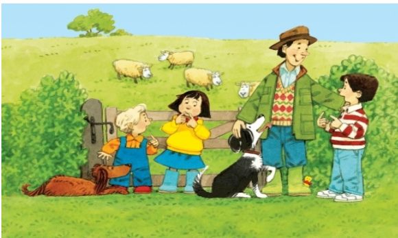
Figure 1. Amery, H., Cartwrightom, S. (2017). Farmyard Tales Storybooks , Planeta Zoe.

In order to fulfill their function in preschool mathematics education, it is important to choose the picture books properly. The educator must select carefully the picture book bearing in mind, above all, the aim that he wants to achieve in the field of mathematics learning. For example, the contents of the following picture book (Figure 1) can be used for perception, spotting, selecting and naming of positions left-right, front-behind-between (What's left / right of a girl in a yellow sweater? What is behind her? What is in front of, and what is behind the shepherd? Who is located between the girl and the boy, etc.), but also for recognizing size ratios: high-low (comparing children's height).