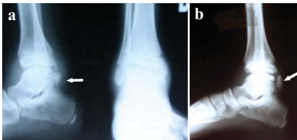
Fig. 1 – a) Preoperative radiographs (anteroposterior/lateral projection) and b) Radiograph of the recidive, showed an osteocartilaginous protuberance of the talus.

Eleven months later the patient again had pain and restriction in the range of right ankle motion, and visited our hospital. New radiography verified recidive (Figure 1b). Surgery was performed again and the specimen was sent for pathological examination. Again, the result showed that the trabecular bone was covered by a thick irregular cap of cartilage, suggestive of an osteochondroma.