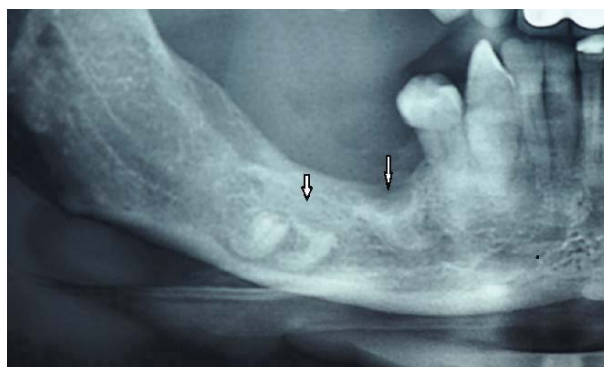
Fig. 4 – Panoramic view of the right mandible and the coronectomied teeth two years after the operation.