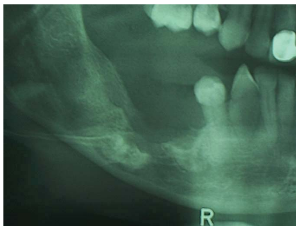
Fig. 3 – Panoramic view of the right mandible and the coronectomied teeth six months after the operation.