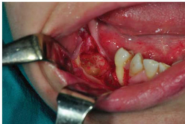
Fig. 2 – Intraoral view of the coronectomied teeth.

postoperatively did not show any movement of the roots left in the mandible; the molar roots were fully covered by bone and premolar roots only partially (Figure 4).