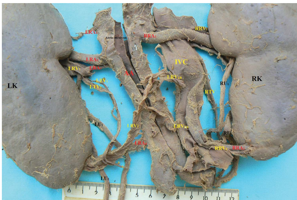
Figure 2. Renal system — back view; IVC — inferior vena cava; AA — abdominal aorta with an aneurysm; RK — right kidney; LK — left kidney; RU 1 — the first right ureter; RU 2 — the second right ureter; LU 1 — the first left ureter; LU 2 — the second left ureter; RRV 1 — the first right renal vein (main right renal vein); RRV 2 — the second right renal vein (inferior polar right renal vein); LRV 1 — the first left renal vein (main left renal vein); LRV 2 — the second left renal vein — retroaortic left renal vein (inferior polar vein); LRV 2a and LRV 2b — two venous trunks of the LRV 2 ; RRA 1 — the first right renal artery (main right renal artery); RRA 2 — the second right renal artery (inferior polar right renal artery); LRA 1 — the first left renal artery (superior polar left renal artery); LRA 2 — the second left renal artery (main left renal artery); LRA 3 — the third left renal artery (the accessory hilar artery); LRA 4 — the fourth left renal artery (inferior polar left renal artery); RTV — right testicular vein; LTV 1 — the first left testicular vein; LTV 2 — the second left testicular vein.