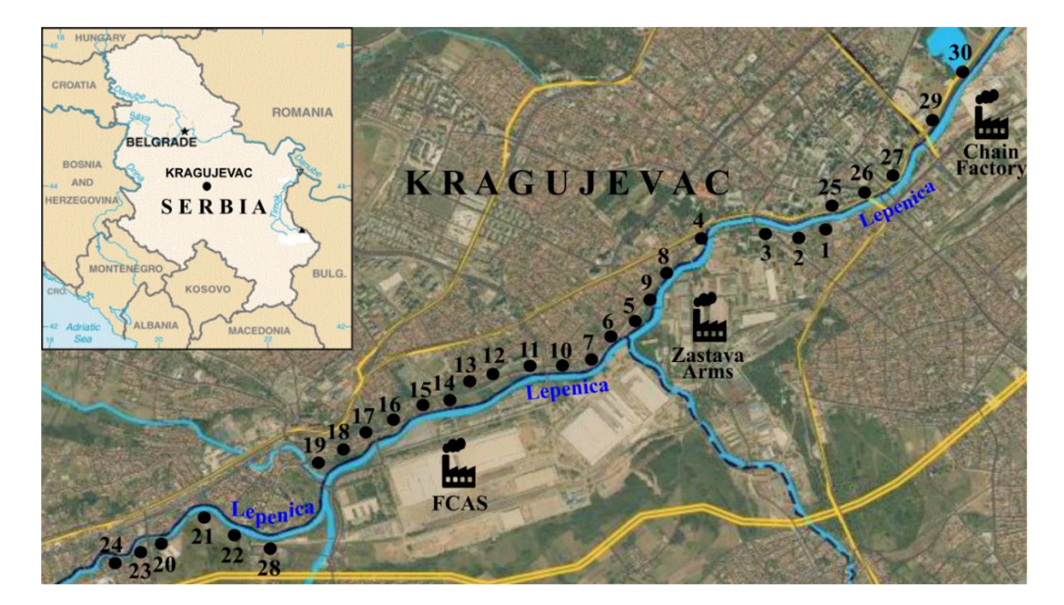
Fig. 1. Map of the study area

With a population of about 150 000 (2011 census), Kragujevac (43° 59' N; 20° 53' E) is one of the biggest cities in Serbia, and the administrative center of Šumadija District. It lies at 180 meters above the sea level and it is located in the valley of the Lepenica River, a small tributary of the Velika Morava, which in turn flows into Danube. This region has a continental climate and the average annual rainfall of 618 mm. Kragujevac is known for its automobile (Fiat Chrysler Automobiles Serbia - FCAS) and munitions (Zastava Arms) industry. Besides, there are several minor industrial facilities for producing asphalt materials, panel furniture, technical chains, paints and varnishes, etc.