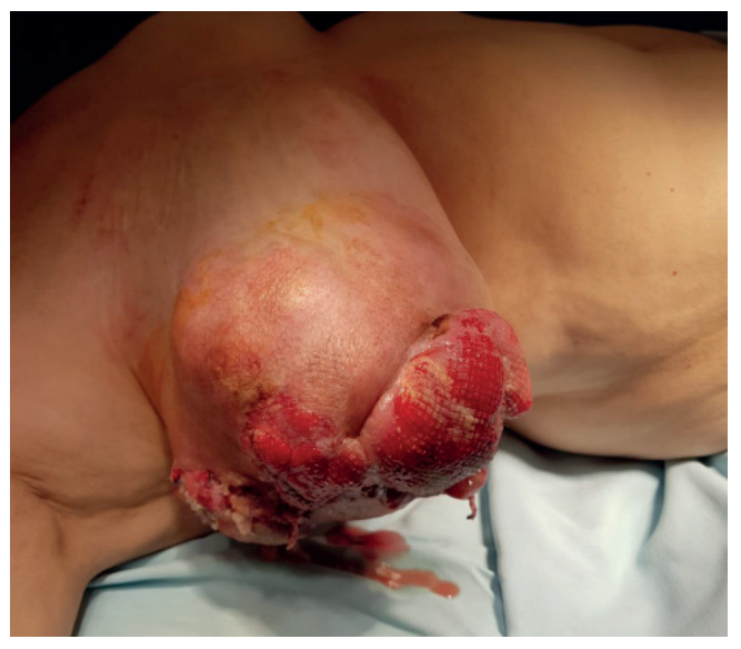
Figure 1: Right breast with deformation caused by a tumor