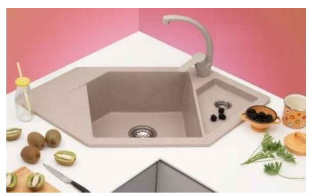
Fig. 7. Applications engineered stone materials for the kitchen sink [27]