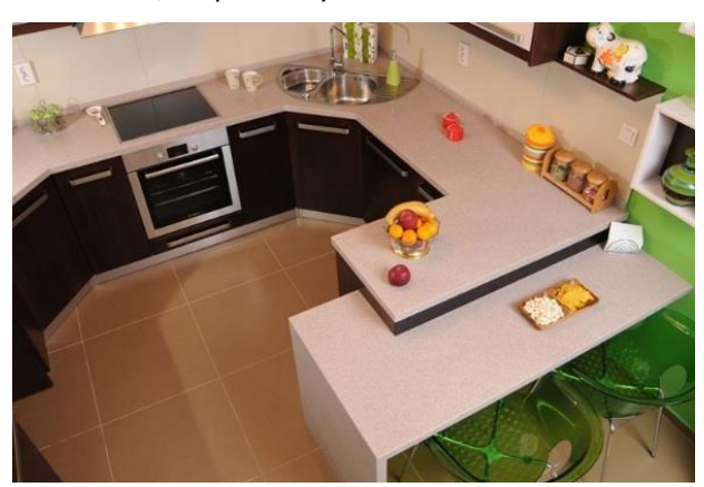
Fig. 3. Applications solid surface materials in kitchens by Metalac INKO [13,27]

Fig.3, 4 and 5 shows some of the applications solid surface materials in kitchens, laboratories and bathrooms, respectively.