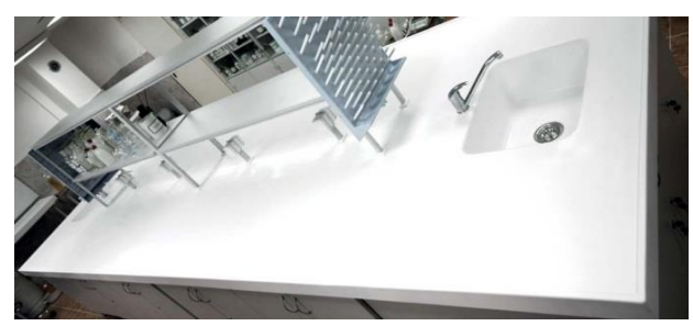
Fig. 4. Applications solid surface materials in laboratories by Metalac INKO [13]