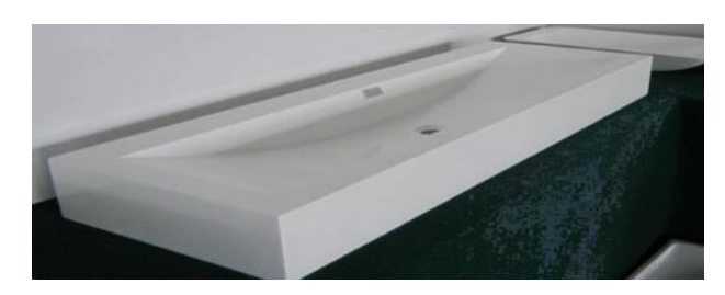
Fig. 8. Applications engineered composites materials with gel coat in bathroom [29]

As previously stated, engineered composites with gel coat are used in bathroom vanity, basins and shower surrounds. Some of the applications of engineered composites were shown in Fig.8.