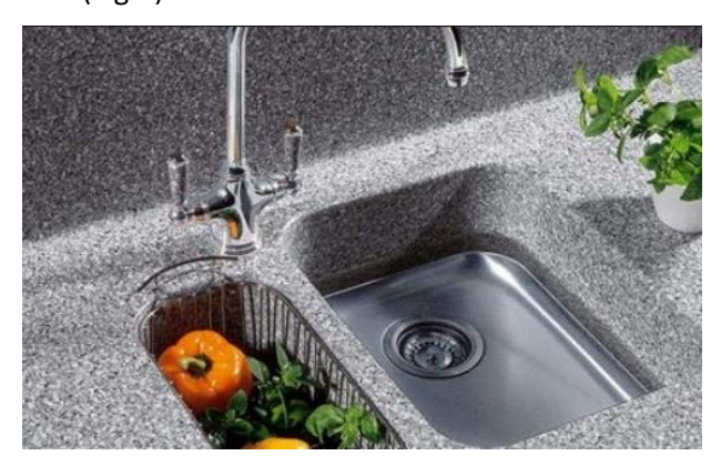
Fig. 6. Applications engineered stone materials for indoor walls and kitchen countertops [28]

The engineered stones with very low porosity show very good performance in a large variety of applications that require materials with colour consistency and mechanical strength, as well as maintenance free surfaces. Different engineered stones are available in the market, presenting different compositions, textures and colours [14]. Engineered stone are used for panels for indoor flooring and walls use engineered marbles (Fig.6), and engineered stone the quartz based product is used primarily for kitchen countertops as an alternative to laminate or granite [12]. Engineered stone the quartz based also used for the kitchen sink (Fig.7).