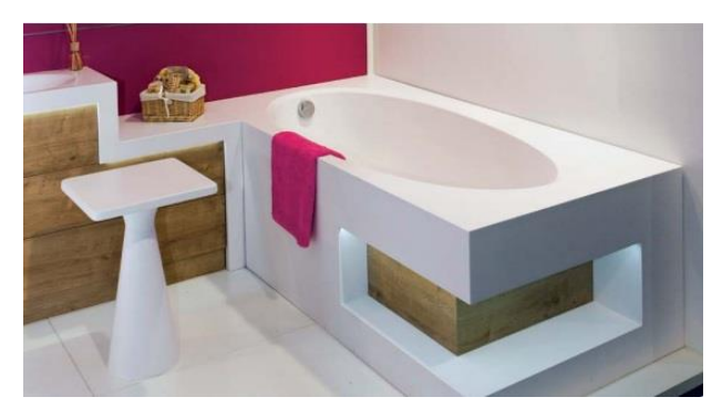
Fig. 5. Applications solid surface materials in bathrooms by Metalac INKO [13]

The engineered stones with very low porosity show very good performance in a large variety of applications that require materials with colour consistency and mechanical strength, as well as maintenance free surfaces. Different engineered stones are available in the market, presenting different compositions, textures and colours [14]. Engineered stone are used for panels for indoor flooring and walls use engineered marbles (Fig.6), and engineered stone the quartz based product is used primarily for kitchen countertops as an alternative to laminate or granite [12]. Engineered stone the quartz based also used for the kitchen sink (Fig.7).