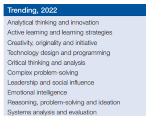
Figure 1. Trending skills demand to 2022 [40].

According to the WEF (World Economic Forum) [40], key skills demand trends include, on the one hand, a continued fall in demand for manual skills and physical abilities and, on the other hand, a decrease in demand for skills related to the management of financial and other resources, as well as, basic technology installation and maintenance skills (Figure 1). Skills continuing to grow in prominence by 2022 include two important topics, such as, “Analytical thinking and innovation” as well as “Active learning and learning strategies.” The sharply increased importance of skills, such as technology design and programming highlights the growing demand for various forms of technology competencies identified by employers surveyed for this report [40]. Proficiency in new technologies is only one part of the 2022 skills equation, however, as “human” skills such as “creativity, originality, and initiative,” “critical thinking,” persuasion, and negotiation will likewise retain or increase their value, as will attention to detail, resilience, flexibility, and “complex problem-solving.” “Leadership and social influence” as well as “emotional intelligence” and service orientation, also will see an outsized increase in demand relative to their current prominence [40].