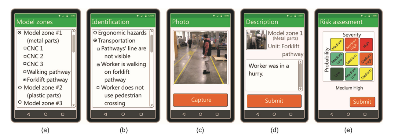
Figure 5. Example of forklift pathway, (a) Model zones, (b) Identification, (c) Photo, (d) Description, (e) Risk assessment.

It could also be noticed (from Figures 3–5) that the system enables a high level of usability heuristics, providing good visibility of the system status, a good match between system presentation and the real world (actually one of the options is real-life examples), good user control, consistency of presentation, flexibility and efficiency, minimalistic design (that is very important for mobile solutions). At this stage (as future development), it is necessary to make an effort to include help and documentation as well as to provide a higher level of error protection including recovering from errors.