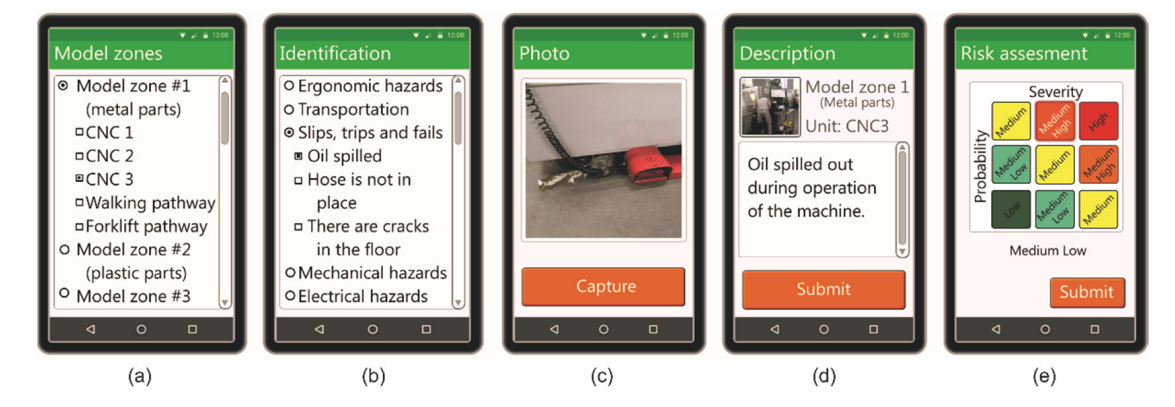
Figure 4. Example of oil spill in the category of the hazards such as slips/trips/falls, ( a ) Model zones, ( b ) Identification, ( c ) Photo, ( d ) Description, ( e ) Risk assessment.

After finalization of all the steps shown in Figure 4, the student can proceed to the next UA/UC (i.e., oil spill in the category of the hazards such as slips/trips/falls—Figure 4 or forklift pathway—Figure 5). These examples depict a number of practical examples that could be solved and used in safety education. It is important to emphasize that all real-industry reports collected by students could be potentially used for the OSH education—after the professor approves and assigns the same as appropriate educational material. In this way, students could be encouraged or recognized for their contribution to the learning materials database. In addition, any hazard which was initially omitted to be identified could afterwards be reported by another student. Consequently, the student will be informed about the update and could benefit from the continuous SafeST database improvements. It is also important to emphasize that system has great potential and has already been used in real-life industrial systems, for both purposes: training and reporting.