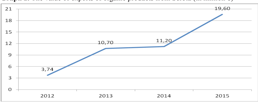
Graph 2. The value of exports of organic products from Serbia (in million €)