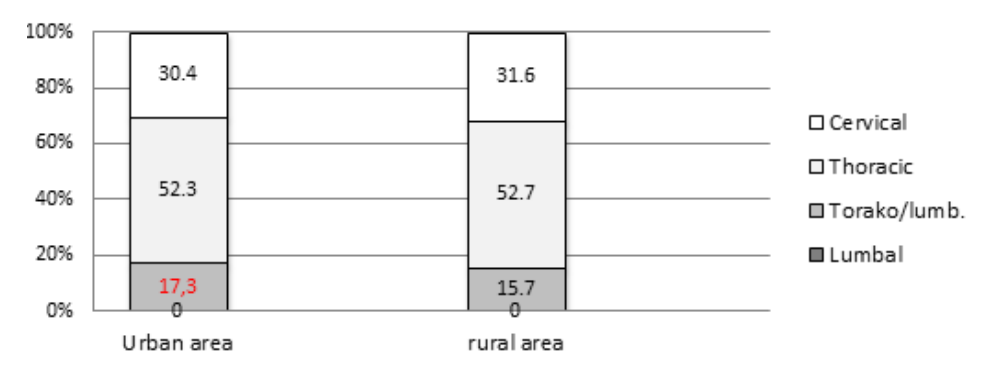
Graph 2. Relative frequency of partial scoliosis in girls depending on the location of deviation

The results of this research have shown that partial scoliosis (PAR) is differently distributed in girls from urban and rural areas (Table 2 and Graph 2). Thoracic scoliosis is most present (TOR), often with the top of the curve at the height of V and VII thoracic vertebrae, and often with left convexity. One school girl had the most severe form of this deformity. Somewhat lower percent refers to cervical scoliosis (CER), structural form of this deformity has been detected in two girls from rural areas (CER). A detailed investigation of the girls indicated that it was the case of a curve in the neck. There was a significantly lower number of cases of thoracolumbar scoliosis (TLB). All three types of scoliosis have proven to be similarly distributed in girls from different socio economic background. It is interesting to note that lumbar (LUM) has not been registered in girls who participated in this research.