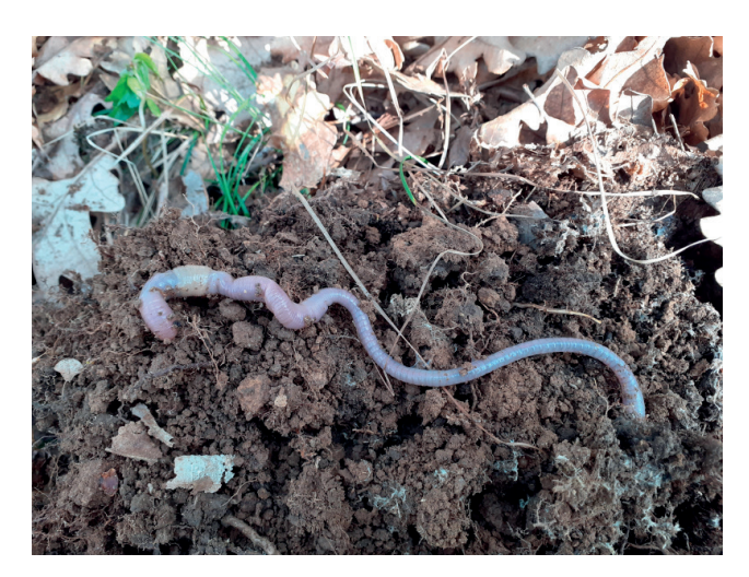
Fig. 2. Living specimen of species Cernosvitovia strumicae in an oak forest on the Western slopes of Kopaonik Mt.