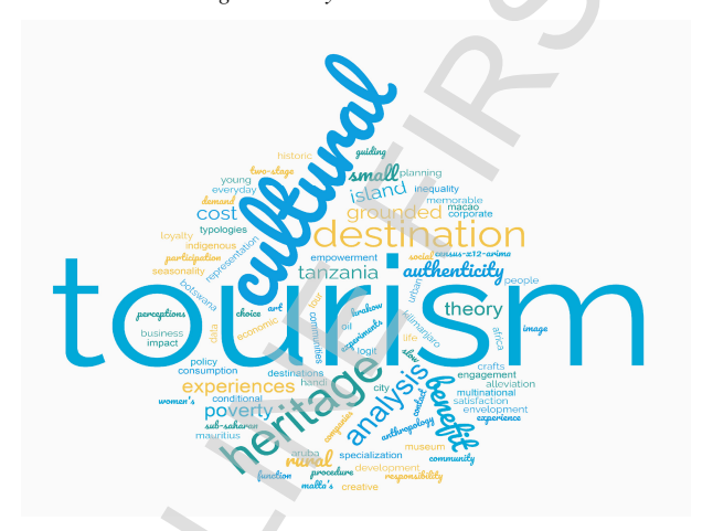
Figure 2: Keyword world cloud