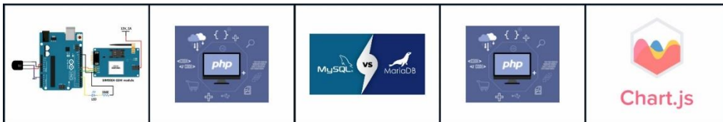
Figure 2. Information system concept

different privilege levels within the third component of the realized software solution, that is, the Corinthian interface.