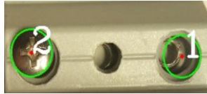
Figure 3. Non-compliant semi-finished product

Based on the results of the system algorithm, which are shown in Figure 2, it can be seen that the product is compliant. In Figure 3, you can see the non-compliant semi-product.