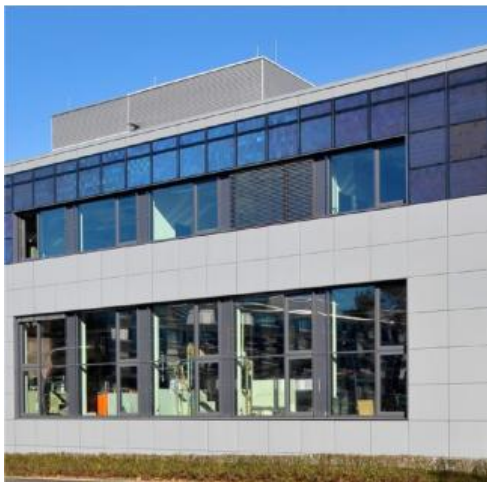
Figure2. Rigid building integrated photovoltaic modules on a laboratory building of Fraunhofer ISE. The BIPV modules were developed and produced in a pilot production facility at the institute. (Ferrara et al., 2017)