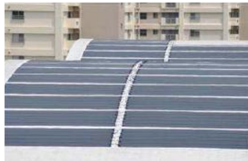
Figure3. Flexible thin film laminates. Global Solar – Roof with flexible CIGS laminat (Global Solar, 2015)