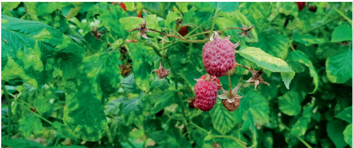
Figure 1. Symptoms of raspberry leaf blotch emaravirus on 'Willamette' leaves

Twenty floricanes with leaf blotch symptoms and 20 asymptomatic floricanes were randomly selected from each orchard. In total, 160 canes were selected from 4 orchards. Symptomatic canes expressed typical leaf blotch symptoms: yellow blotches and patches, leaf twisting and distortion (Figure 1). To analyze the presence of RLBV in the selected canes, 5 leaves were sampled from each cane in May 2019. Leaves originating from the same cane represented one sample.