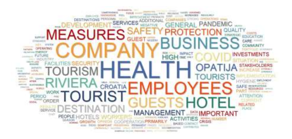
Figure 1. Graphical representation of the results: QDA Miner