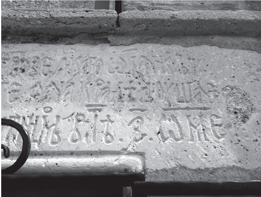
Fig.2. Part of the ktetorial inscription on the architrave of the west portal, St. Nicholas church, Ljuboten

Сл.2. Део ктиторског натписа на архитраву западног портала, црква Св. Николе, Љуботен