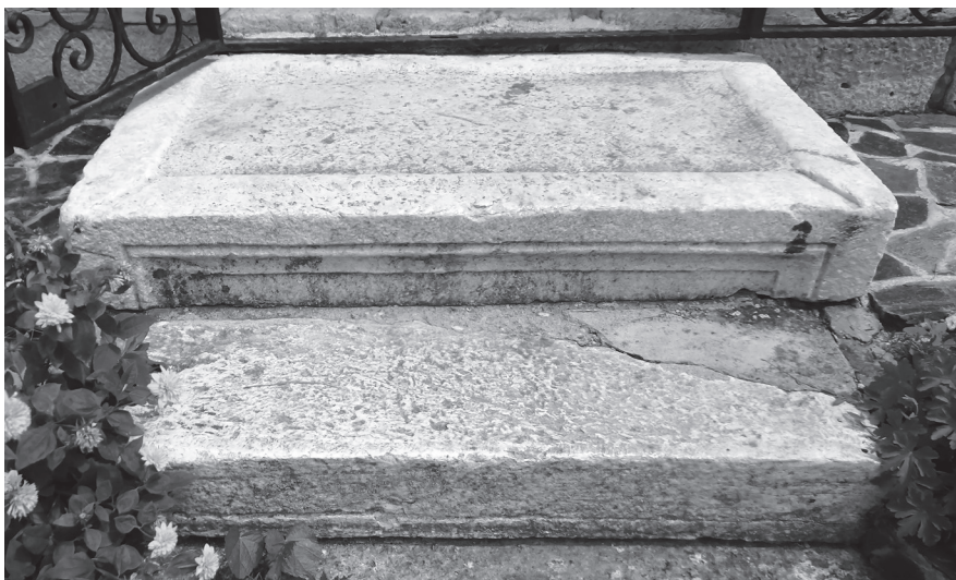
Fig.6. Spolia in front of the west entrance, St. Nicholas Church, Ljuboten

Сл.6. Сполија уграђена испред западног портала, црква Св. Николе, Љуботен