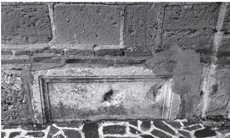
Fig.4. Spolia inserted at the lower register of the north wall, St. Nicholas Church, Ljuboten

Сл.4. Сполија уграђена у доњи регистар северног зида, црква Св. Николе, Љуботен