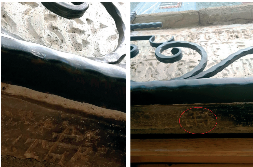
Fig.8, 8a. View of the carved monogram and the executed inscription on the frontal side of the architrave, St. Nicholas church, Ljuboten

Сл.8, 8a. Поглед на урезани монограм и изведени натпис на чеоној страни архитрава, црква Св. Николе, Љуботен