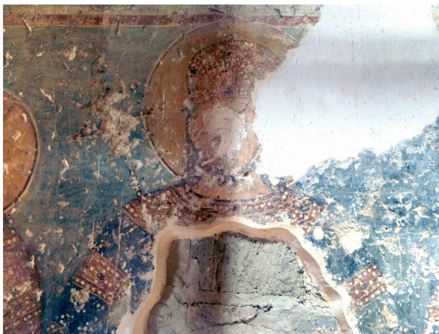
Fig.3. Portrait of the King Stefan Dušan, north wall, zone of the standing figures, St. Nicholas church, Ljuboten

Сл. 3 Портрет краља Стефана Душана, северни зид, зона стојећих фигура, црква Св. Николе, Љуботен