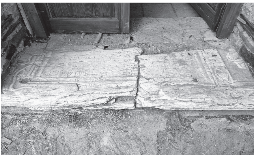
Fig.10. Spolia incorporated into the threshold of the southern portal of the Church of the Mother of God, Mateič monastery, photo: Jasmina S. Ćirić

Сл.10. Сполија уграђена у праг јужног портала Богородичине цркве, манастир Матеич, фото: Јасмина С. Ћирић