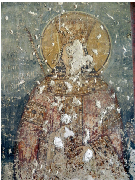
Fig.7, 7a, 7б. Queen Helen Nemanjić Asen and Uroš V (on the right side), north wall, zone of the standing figures, St. Nicholas church, Ljuboten

Сл.7, 7а, 7б. Краљица Јелена Немањић Асен и Урош V (десно) северни зид, зона стојећих фигура, црква Св. Николе, Љуботен, фото: Јасмина С. Ћирић