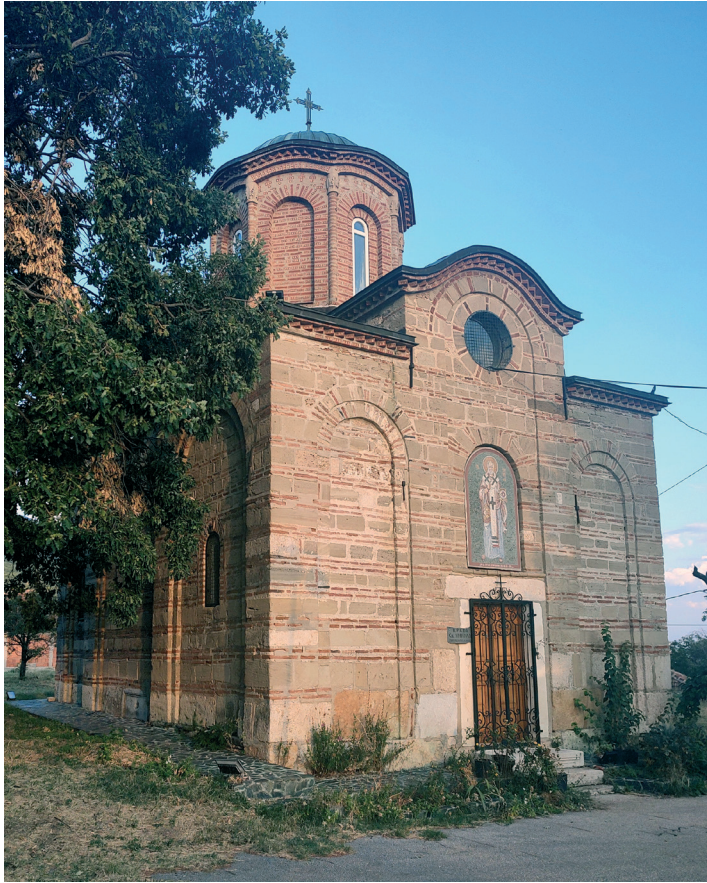
Fig.1. St. Nicholas church, Ljuboten

Сл.1. Црква Светог Николе у Љуботену