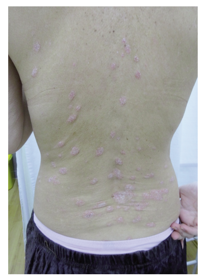
Figure 2. Skin lesions after treatment with etanercept.

TNF inhibitor- etanercept 50mg per week was added to the therapy subcutaneously. She started using etanerceptand 10 months later, she was presented with disseminated erythematous plaques with white patches, smaller non-adherent scaly plaques on the skin of the trunk and extremities, predominantly lumbosacral. In frontoparietal scalp erythematous plaques were presented, covered with distinctive white patches with thinning hair (Figures 1 and 2). Laboratory results: SE 30/, RF 320, anti CCP At 280, ANA negative, virological analysis-negative, the other values in the normal range.