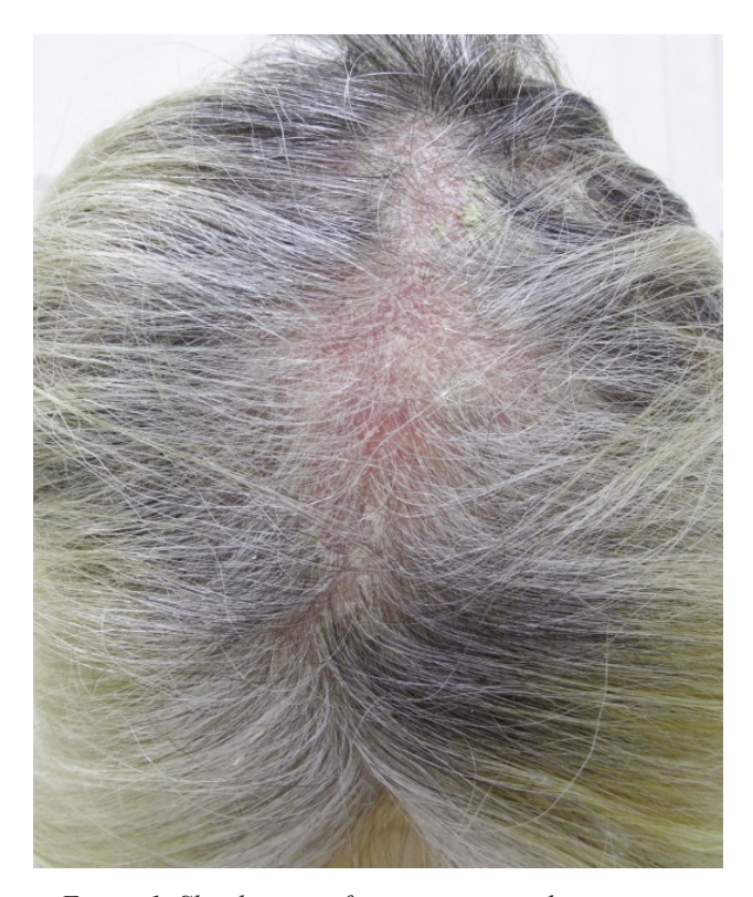
Figure 1. Skin lesions after treatment with etenercept.