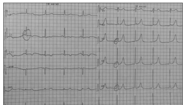
Figure 2. Electrocardiogram findings after amiodarone administration show characteristic signs of WPW syndrome: sinus rhythm with regular ventricular rate of 60 bpm, short PR interval (< 120 ms), widened QRS complexes (100 ms) with RSR' configuration in lead V1, ST depression and negative T wave in leads D2, D3, aVF, delta wave as a slurred upstroke in the initial portion of QRS complex, prolonged QTc interval (Bazzet's formula) = 471 ms

RBBB – right bundle branch block; VT – ventricular tachycardia; SVT – supra-ventricular tachycardia