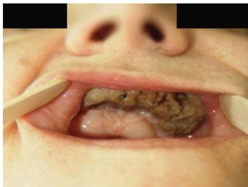
Fig. 3 – Clinical finding.