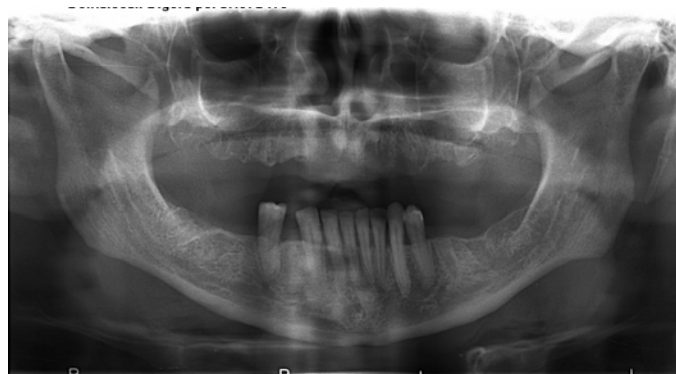
Fig. 1 – Orthopantomography (OPT) shows alveolar bone loss and regions of osteosclerosis.