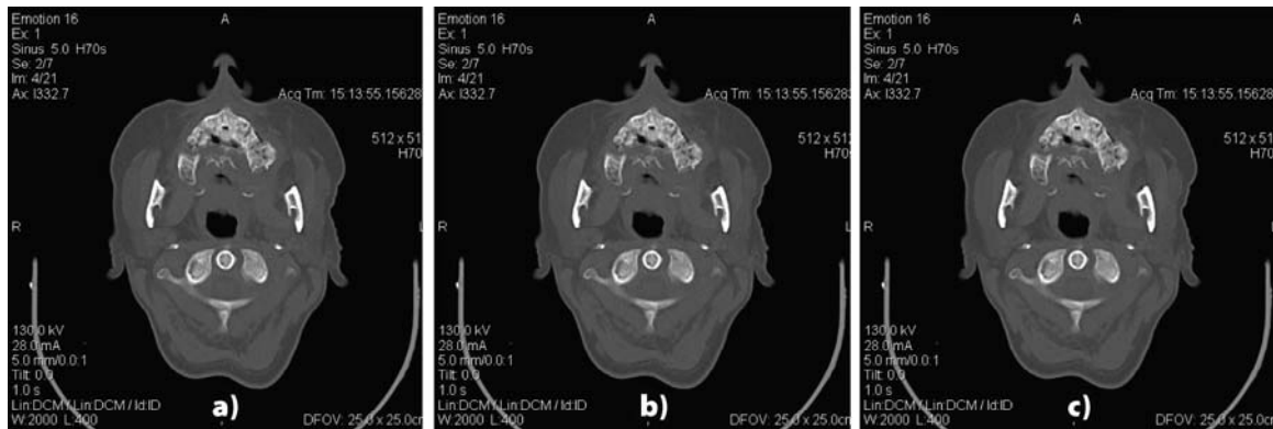
Fig. 2 a-c – Computed tomography (CT) of the midface shows demineralization, discontinuity of the corticocalix with numerous sequestrations in the region of both maxillary alveolar process and palatine bone.

terms of demineralization, discontinuity of the corticocalix with numerous sequestrations in the region of both maxillary alveolar process and palatine bone, the changed mucous membrane of both maxillary sinuses, nasal hall and ethmoidal cell to the left (Figure 2). The stage 3 of BRONJ was diagnosed (Figure 3). According to the Naranjo Adverse Drug Reaction Probability Scale 6 this condition was estimated as a definitive adverse drug reaction (score 9). The patient was operated in October 2015. The sequestrectomy was done, which included resection of the both alveolar ridge of maxilla and part of the hard palate (Figures 4 and 5), and reconstruction with an obturator (Figure 6). Because of local status, the primary reconstruction with micro vascular flap was not plan-