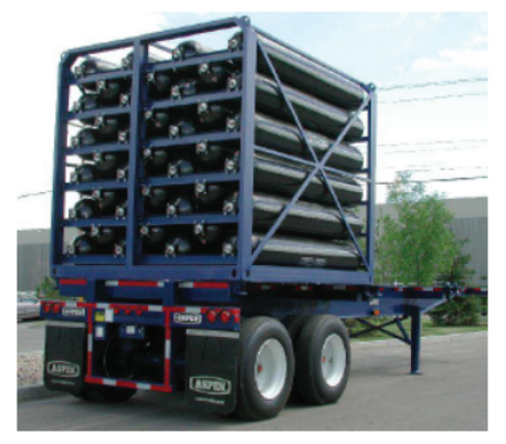
a) ISO 20 ft. container (b) 10 ft. cube for bulk transport Figure 3: Containers for CNG bulk transport (250 bar modules)