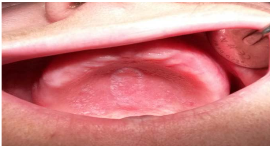
Slika 2. Eritematozni (generalizovani oblik) proteznog stomatitisa Figure 2. Erythematous (generalized type) denture stomatitis.