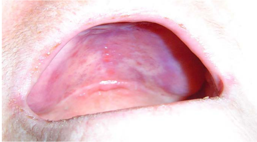
Slika 1. Tačkasta hiperemija sluzokože uzrokovana traumom pri nošenju gornje totalne proteze Figure 1. Localized pinpoint hyperemia of the mucosa, which is caused by denture trauma.