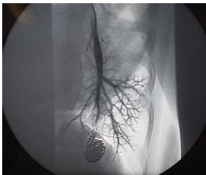
Fig. 5 – Left lower lobe arteriovenous malformation and feeding vessel embolized, complete out of circulation.