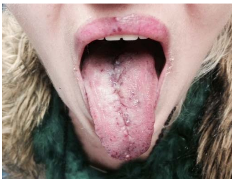
Fig. 1 – Mucocutaneous telangiectasia of the tongue and the lips.

MSCT contrast pulmonary angiography showed hyperdense peripheral zones in posterobasal segments of both lungs with the diameter of 20 \times 18 mm for the right and 28 \times 14 mm for the left one. After iv contrast, feeding and drainage blood vessels were clearly presented (Figure 2).