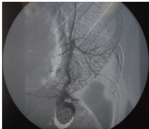
Fig. 4 – Left lower lobe arteriovenous malformation partially embolized.