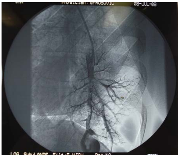
Fig. 3 – Left lower lobe arteriovenous malformation catheterization.

After ten years of testing epistaxis, hypertension and hemoptysis, the patient was diagnosed with HHT or Osler-