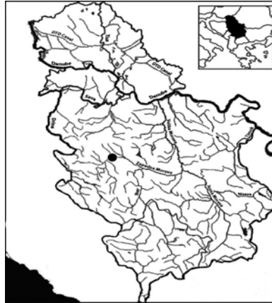
Figure 1. Location of the Međuvršje reservoir (Serbia)

The Međuvršje reservoir was created in 1953 by constructing a 31 m high concrete dam at 182 km downstream (Figure 1.).