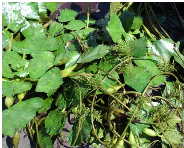
Figure 3. Trapa natans in the study area

T. natans is an invasive and highly expansive species within the biotope analyzed. The drastic increase in T. natans populations may result in root competition between this species and other macrophytes. The dense rosette of its floating leaves (Figure 3.) can shade out photosynthetic surfaces of indigenous macrophytes and, hence, reduce the rate of primary production of competing species. Although the effects of further propagation of the species on overall hydroecologic characteristics of the ecosystem are difficult to predict, certain preventive measures should be taken to limit its expansion. Mechanical removal of T. natans from parts of the lake most abundant in its populations is a realistically practicable operation. Potential expansion and effects of T. natans on the chemistry of the ecosystem and qualitative and quantitative structure of macrophyte communities of this ecosystem should be monitored, similarly to monitoring activities conducted in Bulgaria (Yocheva et al., 2013) or Croatia (Vukojević and Vitasović-Kosić, 2012)