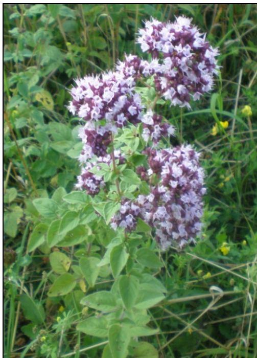
Figure 1. Origanum vulgare L. in flowering stage.

O. vulgare is a well-known culinary herb whose leaves can enhance the flavor of food. The species is also used in traditional and modern medicine and in pharmaceutical industry. In a number of studies, large amounts of active secondary metabolites as well as a variety of biological activities of this plant were evaluated [2,3].