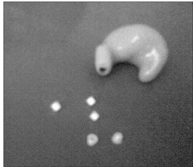
Figure 2. In-channel hearing aid and the original position of extracted foreign objects from the external auditory canal of the second patient

We had a case of a 5-year-old patient whose olives had to be changed. The girl wore hearing aids due to the hear-