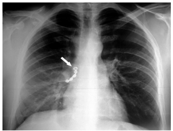
Fig. 1 – Anterior-posterior chest radiograph showed a partial denture (arrow) in the right hilum